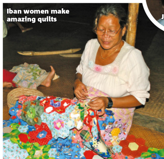
Iban women make amazing quilts