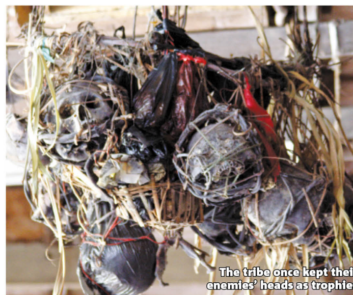
The tribe once kept their enemies' heads as trophies

We say goodbye to our friendly hosts and begin our journey by canoe back to the town. One thing's for sure – this is one sleep over we'll never forget!