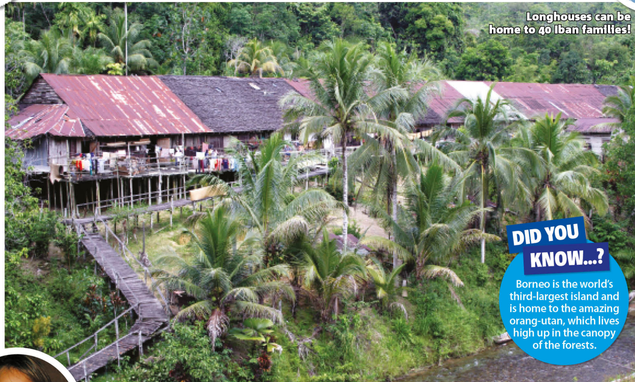
Longhouses can be home to 40 Iban families!

Keen to prove themselves as fierce warriors and defend their lands, Iban tribesmen would cut the heads off their enemies, before preserving, and hanging them up as trophies to show their strength. Yikes!