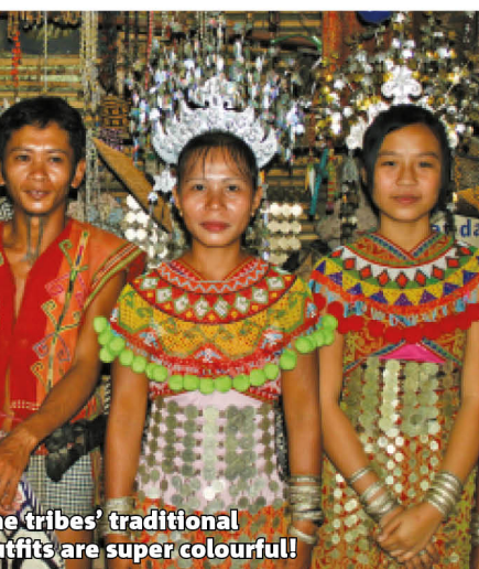
The tribes' traditional outfits are super colourful!