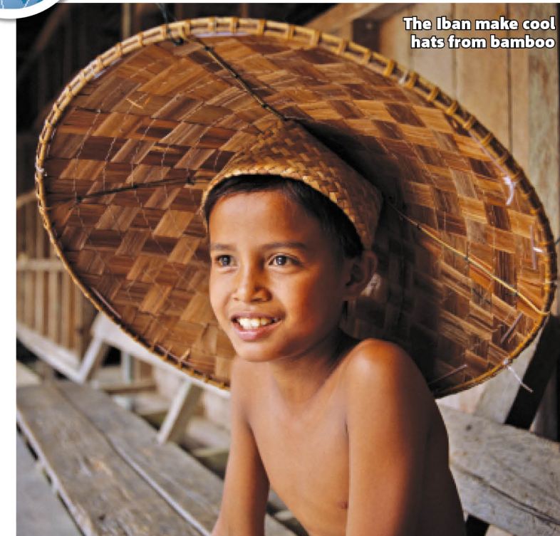
The Iban make cool hats from bamboo

Borneo is the world's third-largest island and is home to the amazing orang-utan, which lives high up in the canopy of the forests.