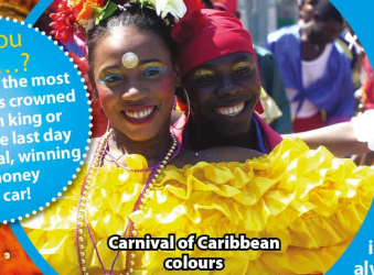
Carnival of Caribbean colours

Did you know...? The singer of the most played song is crowned Road March king or queen on the last day of the carnival, winning prize money and a car!