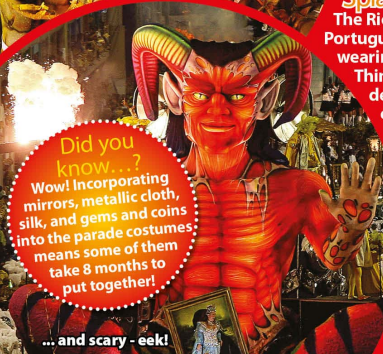
... and scary - eek!

Did you know...? The singer of the most played song is crowned Road March king or queen on the last day of the carnival, winning prize money and a car!