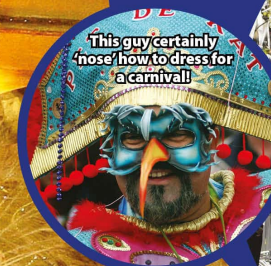
This guy certainly 'nose' how to dress for a carnival!

Did you know...? When it comes to clothing, anything goes in New Orleans. However wearing the traditional carnival colours of purple, green and gold will help