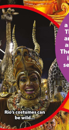
Rio's costumes can be wild...

If you enjoy parties as much as us, you'll have a ball living it up at a carnival! These celebrations have been around for thousands of years and usually happen at Easter. They started off as a way to over-indulge before the religious season of Lent, when everyone is meant to live simply, but they're more about having fun these days!