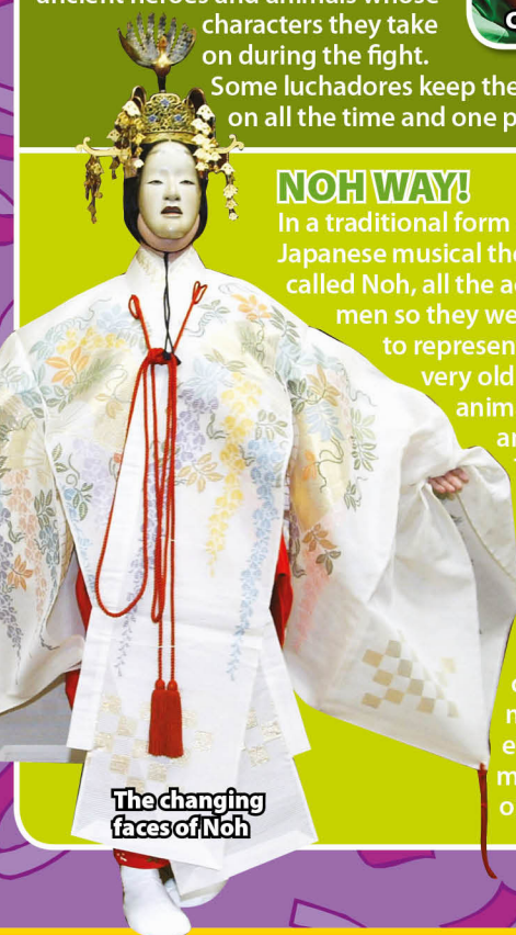
The changing faces of Noh