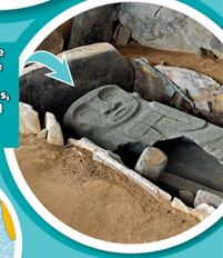
Many of the stones have survived earthquakes, erosion and attempted thefts.