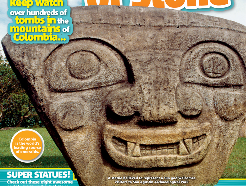
A statue believed to represent a sun god welcomes visitors to San Agustín Archaeological Park.