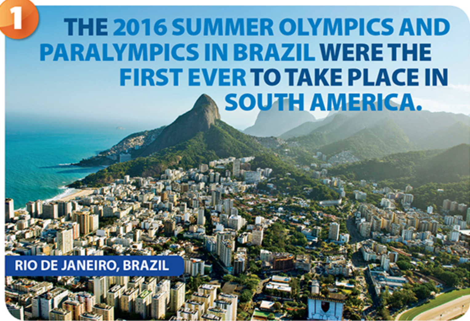
RIO DE JANEIRO, BRAZIL

1 About 200 native languages are spoken in Brazil.