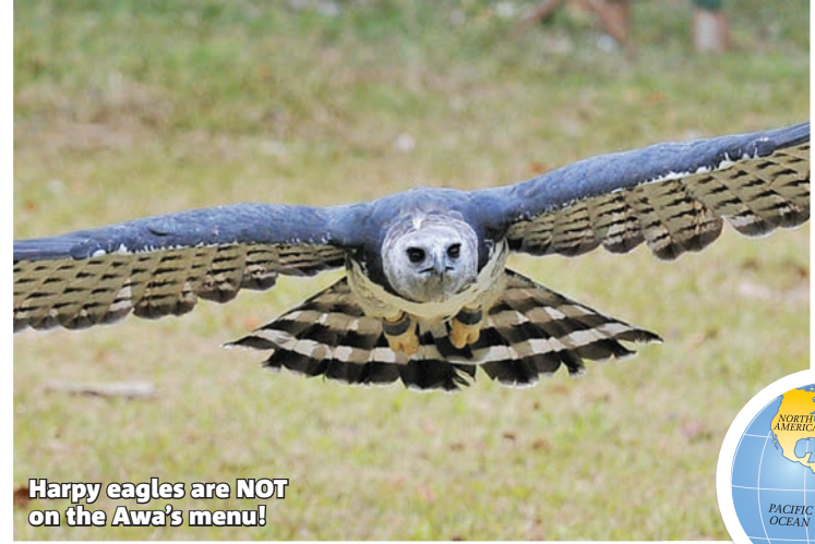
Harpy eagles are NOT on the Awá's menu!