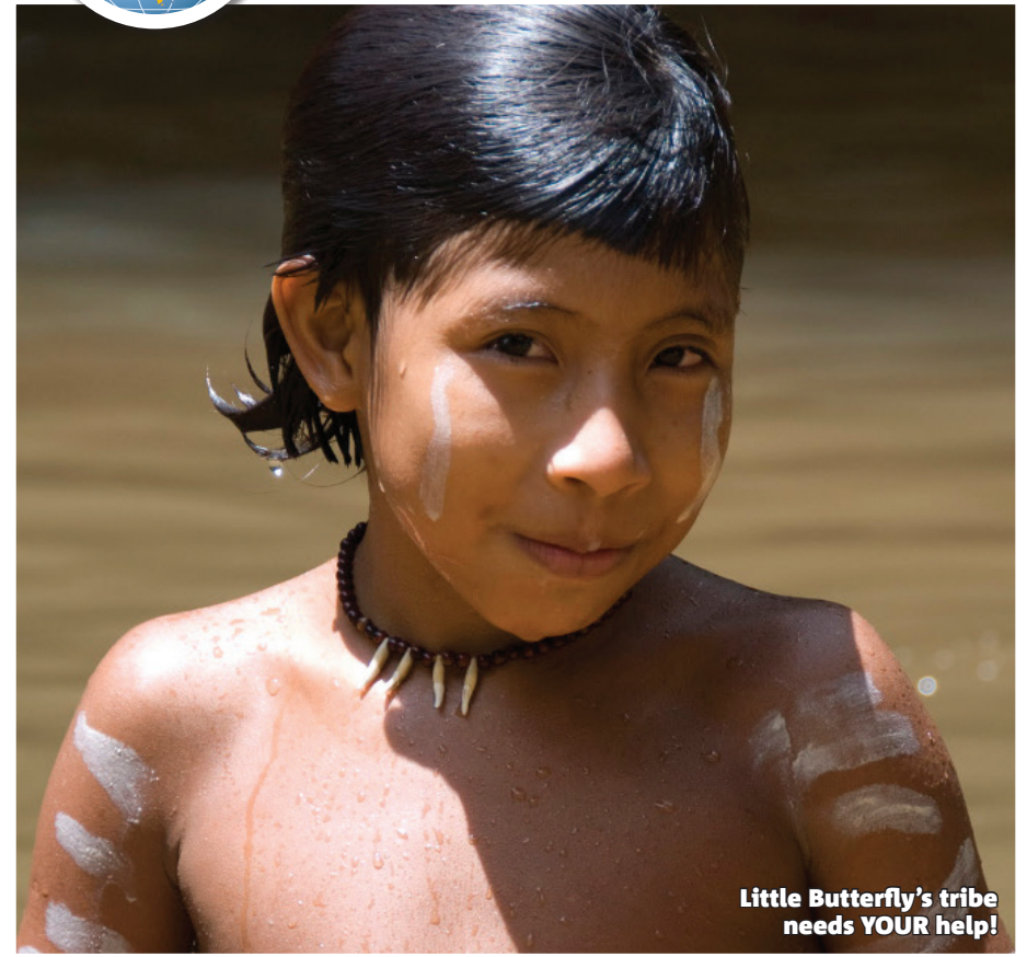
Little Butterfly's tribe needs YOUR help!