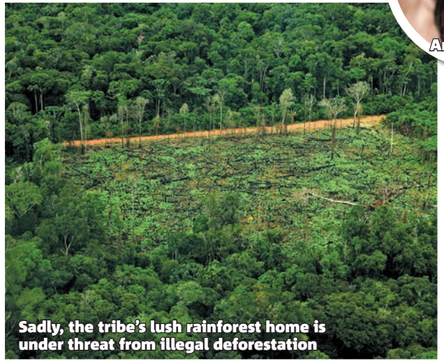
Sadly, the tribe's lush rainforest home is under threat from illegal deforestation