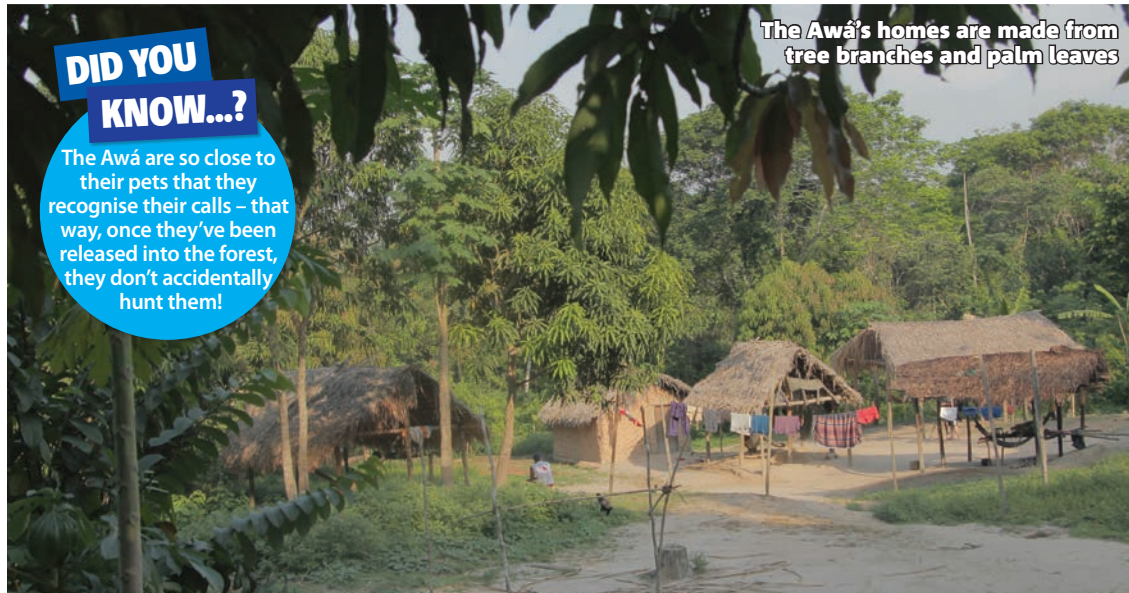
The Awá's homes are made from tree branches and palm leaves

The Awá are so close to their pets that they recognise their calls – that way, once they've been released into the forest, they don't accidentally hunt them!