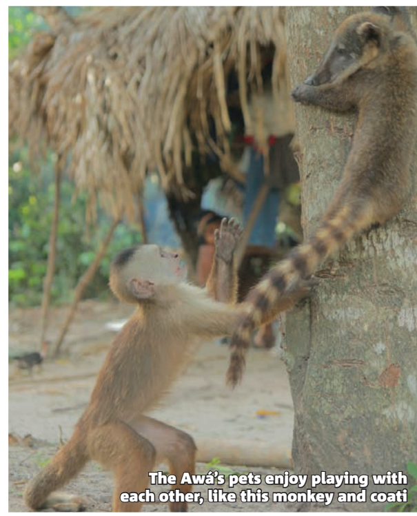
The Awá's pets enjoy playing with each other, like this monkey and coati

About 350 Awá are known to be living in the Amazon today – but it's thought 100 more have had no contact with the outside world, meaning they're some of the last uncontacted people on the planet. Sadly, the forest in which the Awá live is being illegally cut for timber by outsiders. And as the dense rainforest that used to cover vast areas of Maranhão disappears, these hunter-gatherers are vanishing with them. Their bows and arrows are no match for the loggers' guns, and the Awá are now the most threatened tribe in the world. The charity, Survival International, is urging the Brazilian government to stop these illegal loggers destroying the Awá's forest before it's too late. And the good news is that YOU can help. Visit their website, survivalinternational.org/awa now!