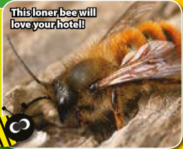
This loner bee will love your hotel!

1 There are about 250 species of bee in the UK, but your buzzin' hotel will probably attract red mason bees, which – unlike honeybees and bumblebees – live on their own instead of with others in a hive.